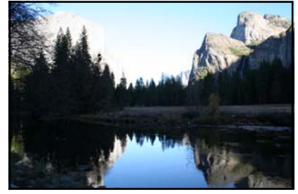
Yosemite National Park